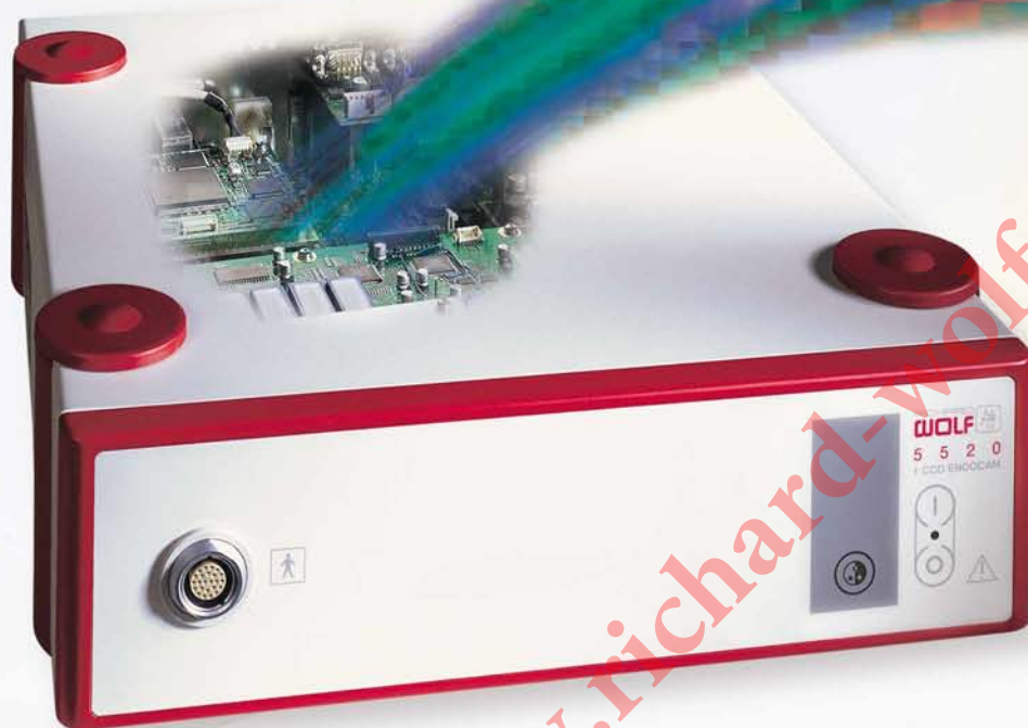
Digital camera system

In addition to the general advantages of digital signal processing in endoscopic camera systems, the new 1CCD ENDOCAM 5520 impresses with its considerably expanded advanced functionality that is otherwise available only by using extra devices: